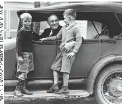
FDR stops to chat, in Warm Springs, on 11-19-1931, while driving his hand-controlled Ford.

Smith thought that he could win the White House only if he carried NY, and that he could carry NY only if FDR ran for Governor, so he avidly pursued FDR.