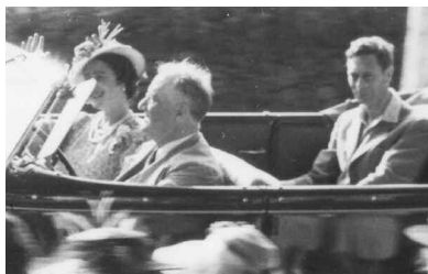
FDR drives the Royals in Hyde Park, on 6-11-1939.

Franklin D. Roosevelt Presidential Library and Museum