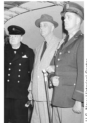
Winston Churchill meets FDR, aided in walking by his son, Elliott, at the "Atlantic Conference" on 8-9-1941.

The communitarian principles embodied in the Warm Springs financial aid rules – that everyone must contribute to the cost of treatment if they could, and that by combining many individuals into a community, the individuals could do, together, what they could not do alone – were incorporated by President Roosevelt, and Secretary Perkins, into Social Security and the Civilian Conservation Corps, which "brought together 2 of Roosevelt's most deeply held values: work and conservation," Jonathan Alter wrote, in The Defining Moment .