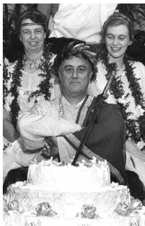
FDR at his Birthday "Toga Party" on 1-30-1934, flanked by ER and daughter Anna.

Franklin D. Roosevelt Presidential Library and Museum