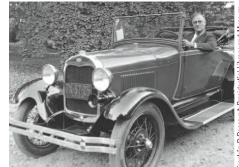
FDR in Hyde Park in 1928, posing in his hand-controlled Ford. Do you think FDR looks crippled?

We think that, if FDR had not been able to drive, using hand controls he designed, after he was paralyzed by polio, then he would not have run for Governor of NY in 1928. If FDR had not been elected Governor in 1928, he would not have been elected President in 1932, and Americans would not have Social Security and the other New Deal reforms, today...and Hitler would have won WW2.