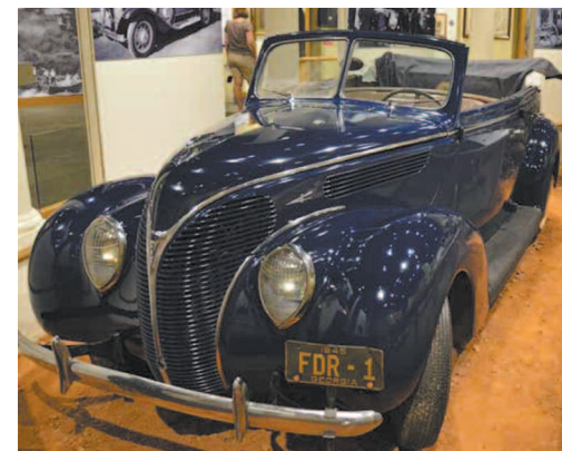
FDR's 1938 Ford, at "Roosevelt's Little White House" in Warm Springs, GA, with the 1945 FDR-1 vanity plates which were on the car when FDR died on 4-12-1945.