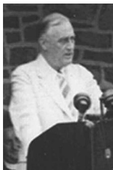
FDR dedicates his library, on 6-30-1941.

"The dedication of a library is...an act of faith. To bring together the records of the past and to house them in buildings where they will be preserved for the use of men and women in the future, a Nation must believe in three things. It must believe in the past. It must believe in the future. It must, above all, believe in the capacity of its own people so to learn from the past that they can gain judgment in creating their own future."