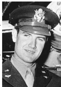
George McGovern in 1944.

Although I never met him, Senator George McGovern was a friend of mine.