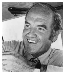
Senator George McGovern in 1972